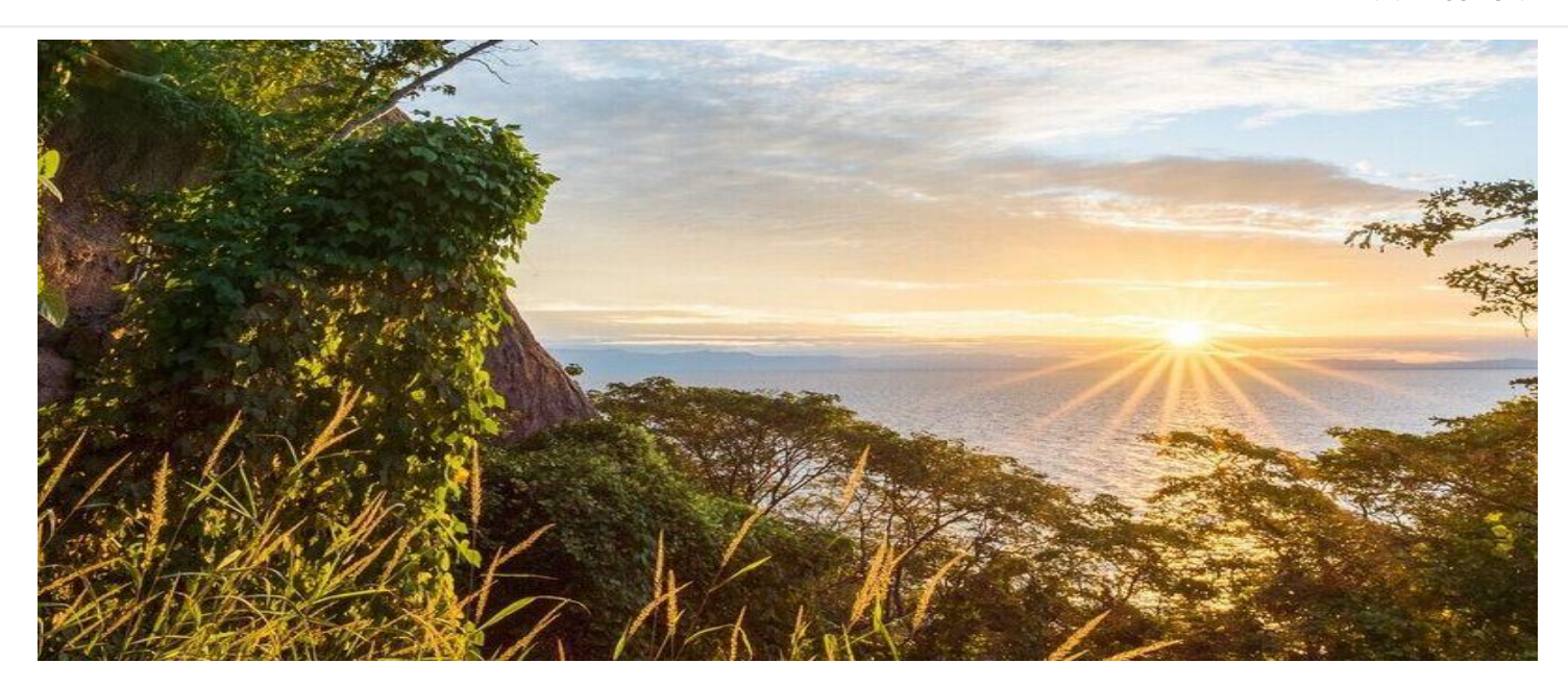
Day 5 | Today we bid you farewell